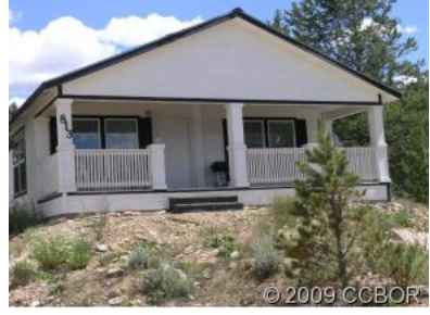
GREAT RENTAL HISTORY!!! 813 Clarendon Avenue