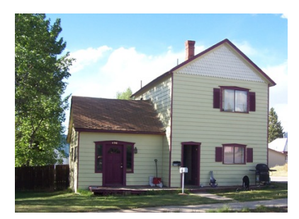
2 UNITS-RENTAL INCOME!!! 400 West 8th St.