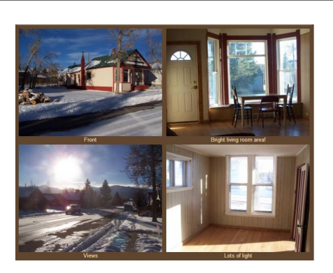
504 West 3rd St. $184,900 FOR SALE!

Total Jan 2013: $135,000 Total Jan 2012: $0